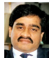
INTERPOL Fugitive Dawood Ibrahim, South Asia "Company D"

Afghanistan/Southwest Asia: Nowhere is the convergence of transnational threats more apparent than in Afghanistan and Southwest Asia. The Taliban and other drug-funded terrorist groups threaten the efforts of the Islamic Republic of Afghanistan, the United States, and other international partners to build a peaceful and democratic future for that nation. The insurgency is seen in some areas of Afghanistan as criminally driven—as opposed to ideologically motivated—and in some areas, according to local Afghan officials and U.S. estimates, drug traffickers and the Taliban are becoming indistinguishable. In other instances, ideologically